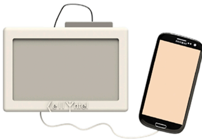
Figure 1. Computer aided design (CAD) rendering of the CellIntel prototype connected to a mobile device.

The prototype device was designed with several key characteristics in mind, which were: (i) lower cost; (ii) touchscreen; (iii) smaller than competitors; (iv) lighter than competitors; (v) easier to assemble; (vi) ability to connect to different mobile devices; and (vii) manually assembled. Thus, the adoption of 3D printing technology to produce the device allows a minimal initial investment for the production equipment, low unit cost, product portability, custom design, and ease of assembly. The project began with the acquisition of two desktop 3D printers, which were not excessively expensive, whose cost lies in the range of $3000 to $10,000. As the precision and the surface finishing of a 3D printer increase, the price rises too. The design of the casing was realized with 3D CAD (Figure 1).