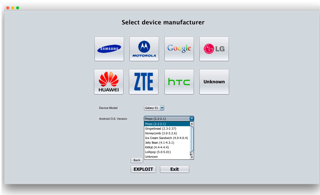
Figure 2. CellIntel prototype user interface during data extraction of an Android smartphone.

The empirical testing performed during the study showed positive results in producing the prototype using the aforementioned techniques. The prototype has similar functionality and improved usability when compared to rivals. After the collaborative hardware and software design described in the previous sections, the CellIntel prototype was produced with a S250 Tiertime 3D printer and was then manually assembled. Subsequently, the software was installed on the device (Figure 2).