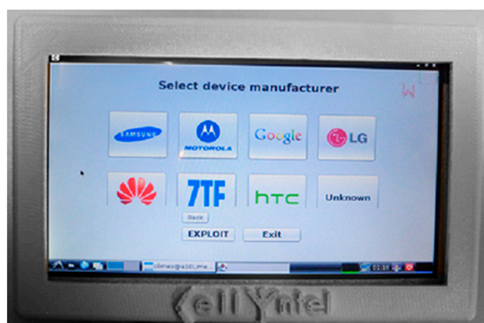
Figure 4. CellIntel assembled prototype in function: touch screen user interface during the choice of the device to be imaged.

Finally, data extractions for forensics investigations, performed with the prototype device CellIntel , were successful with both Android and iOS devices (Figure 4).