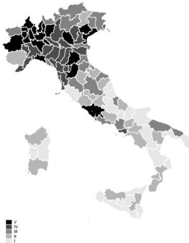
Figure 2: EU market multimodal accessibility index (2001 values)

Note: series values are split into five classes corresponding to distribution quintiles, darker colours are associated with higher values; the darkest color represents the top 20 % of county accessibility.