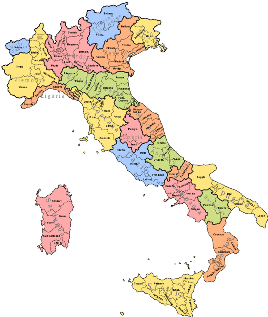
Fig. 1 Italian regions and borders of the provinces

The Fuzzy C-Medoid clustering model has been applied to the provinces based on the eleven competitiveness pillars. A number of clusters from 3 to 6 has been considered and the number of clusters has been selected on the basis of the validity criteria illustrated in Sect. 3. The model has been applied without contiguity constraints to set the number of clusters and the value of the fuzziness parameter. On the basis of the value of the Xie-Beni index C = 3 and m = 1.3 have been selected. A cut-off of 0.60 for the membership has been considered to determine fuzzy provinces (D'Urso et al. 2015). The original 107 provinces have been reduced to 106 by excluding Sud Sardegna newly established (Fig. 1).